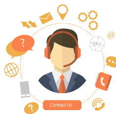
Technical Support from our Export