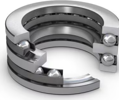
Thrust Ball Bearings