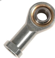
Rod End Bearings