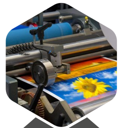
PRINTING & PACKAGING