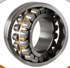
Spherical Roller Bearings