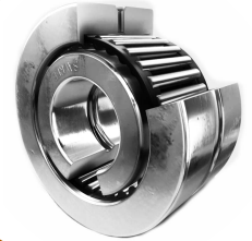
Needle Roller Bearings