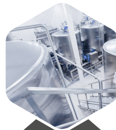
PHARMA & CHEMICAL