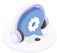
Responsive Customer Service