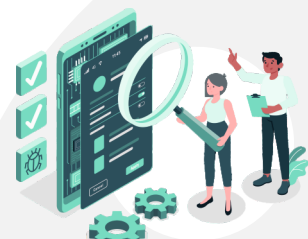
Inspection & Quality Control