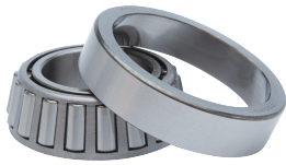
Tapered Roller Bearings