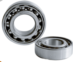
Angular Contact Ball Bearings