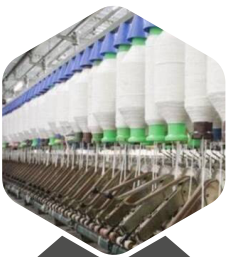
SPINNING & GINNING