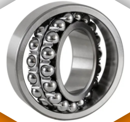
Self Aligning Ball Bearings